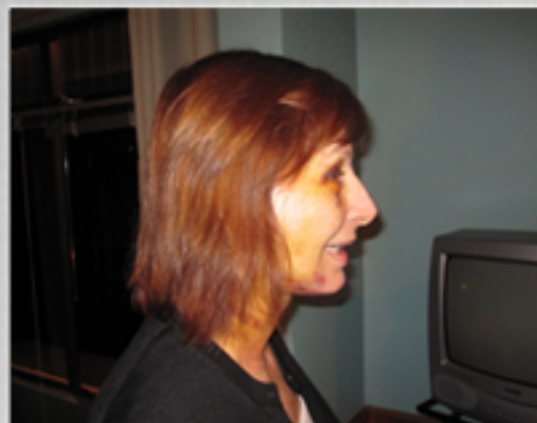
Day 4 - other side view