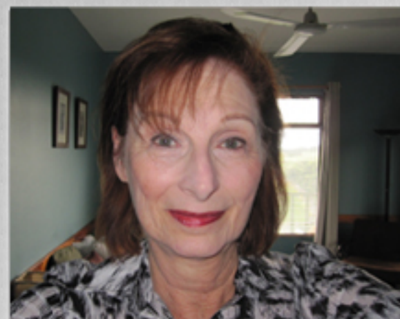
Day before surgery.