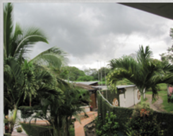
Rain clouds that came in the afternoon.