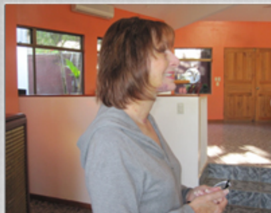
Day 12 - Side View