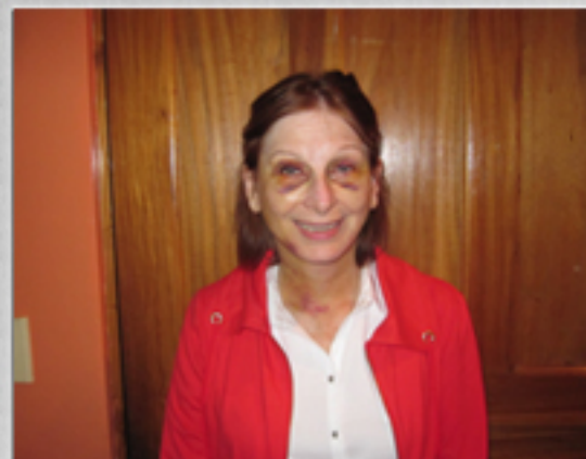
Day 6 - after surgery - bruising and swelling is getting less