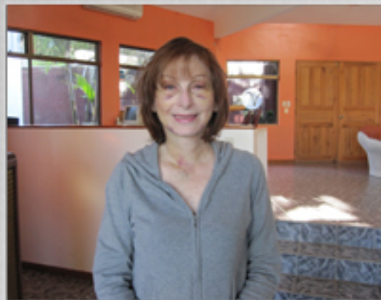
Day 12 -- first day to use a hair dryer