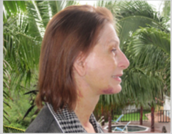
Day 14 - Side View