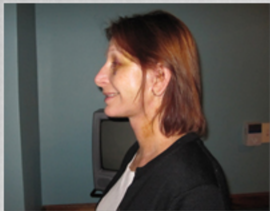
Day 4 - side view