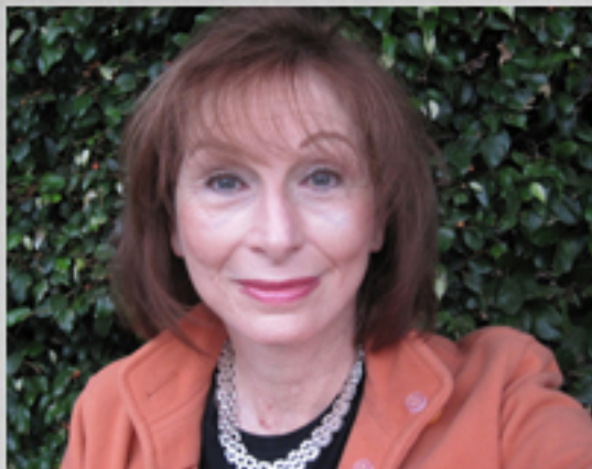
Day 22 after surgery