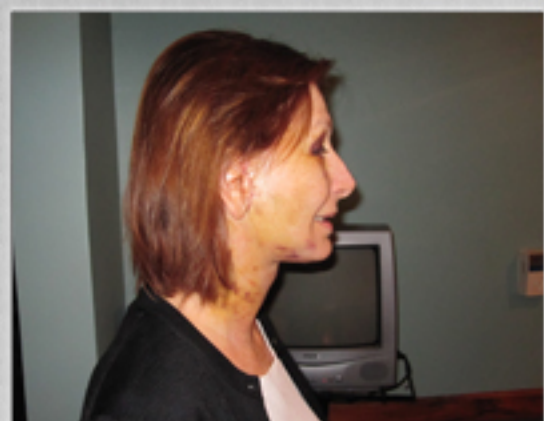
Day 4 - sideview -- bruises turn yellow before the disappear