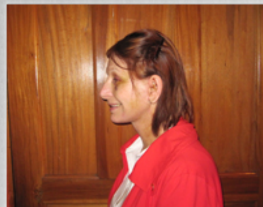
Day 6 - side view