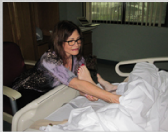
Didi's famous foot rub