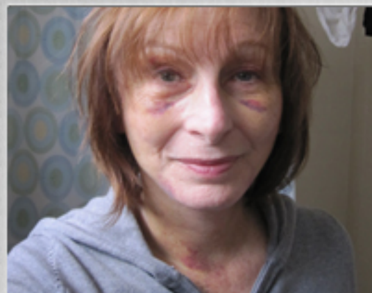
Day 12 - after surgery - less bruising, still pretty swollen