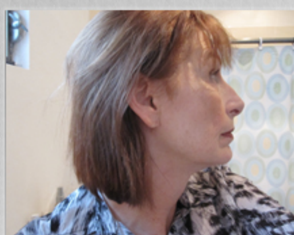
Another from day before surgery.