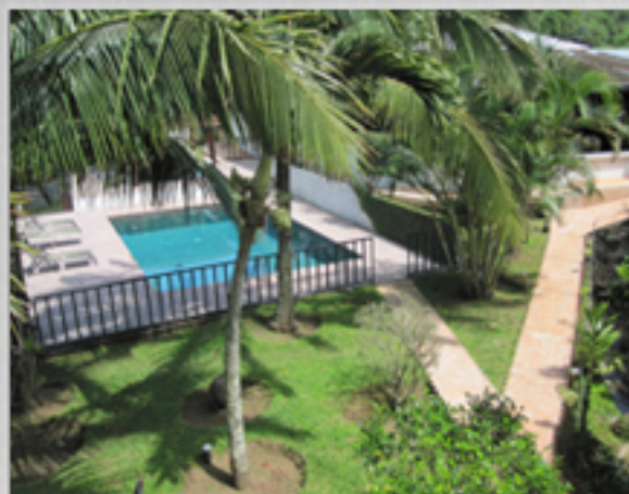
Villa Plenitud-- view from my room.