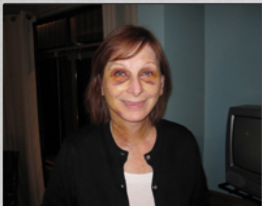
Day 4 - after surgery - first day to wash ones hair