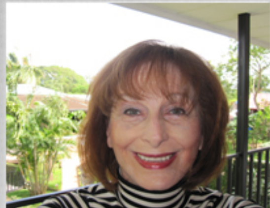
Day 15 after surgery -- hair, make-up and lenses -- ready to travel home