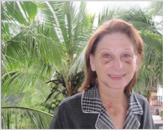
Day 14 after surgery