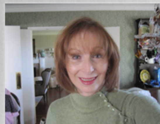
5 weeks after surgery