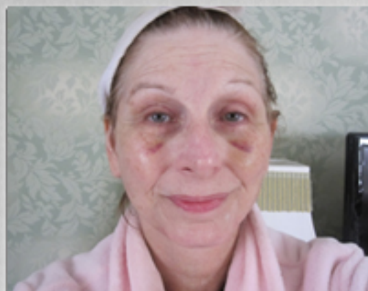
Day 25 - no make-up