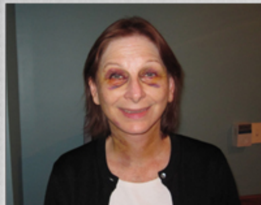
Day 4 after surgery - first day to wash ones hair